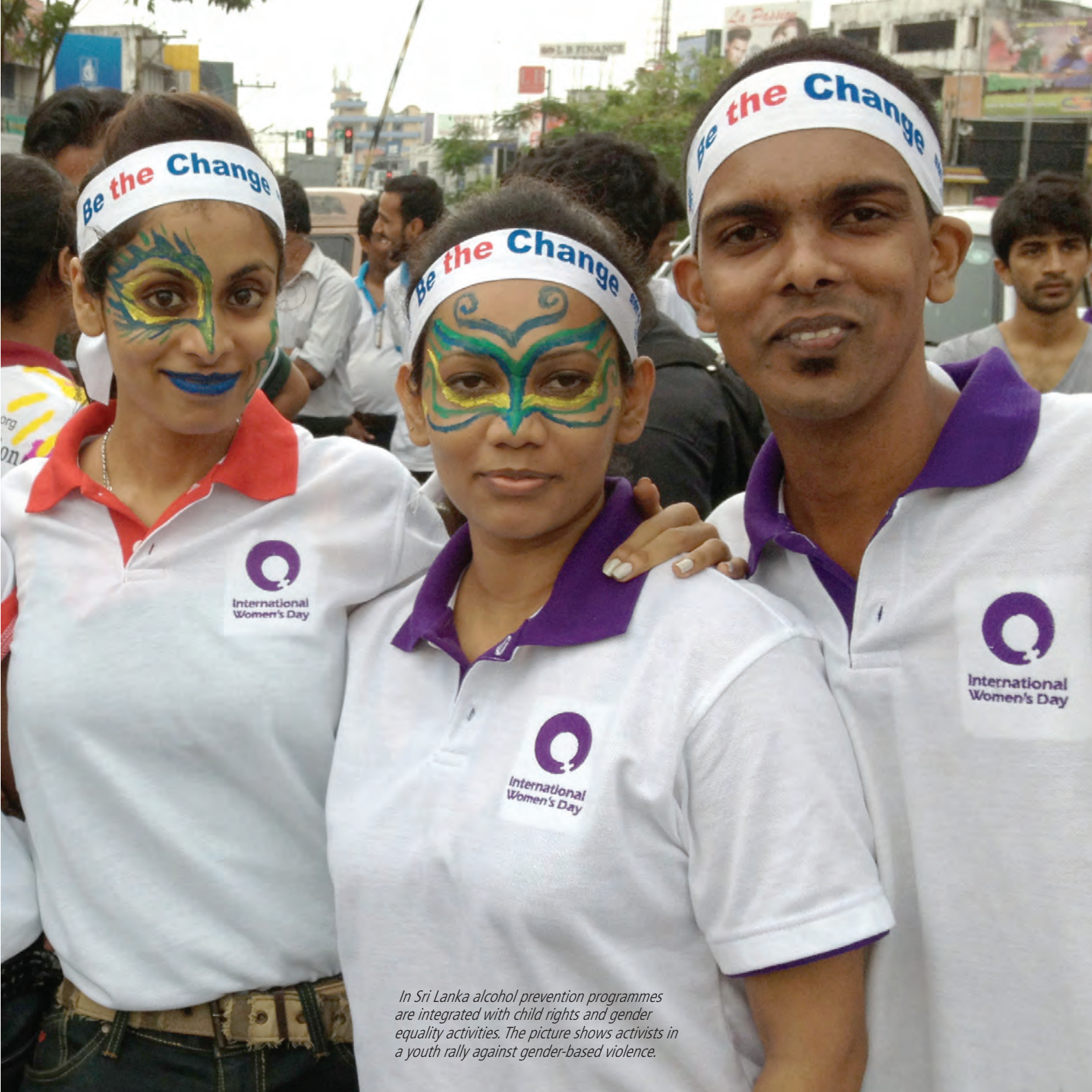
In Sri Lanka alcohol prevention programmes are integrated with child rights and gender equality activities. The picture shows activists in a youth rally against gender-based violence.